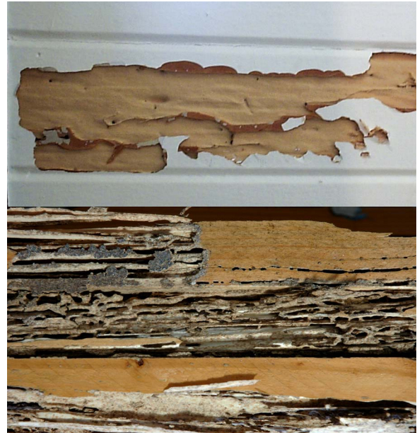
Figure 4. West Indian drywood termite damage (top) is markedly different to subterranean termite damage (bottom). In both examples the outer layer of undamaged timber was removed.

proclaimable pest under the NSW Plant Diseases Act (1924) , making it the legal responsibility of owners and occupiers of land to report its occurrence. If you suspect you have this termite, contact the NSW Department of Primary Industries on 9872 0111.