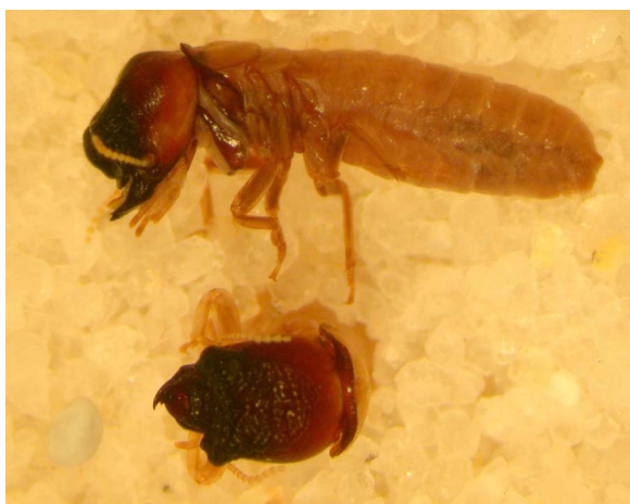
Figure 1. West Indian drywood termite soldiers are approximately 4–5 mm long and have dark, heavily sclerotised heads.

Drywood termites require no contact with the ground, or any other source of moisture, other than that found in the wood in which they are living. A complete colony can exist in a single small piece of dry timber. Because their colonies are completely hidden, these termites may exist undetected for years. The most visible sign of their activity is the sand-grain sized faecal pellets expelled from the colony (see Fig. 2).