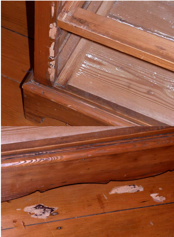
Figure 3. West Indian drywood termite damage. This infestation spread from an imported antique chest of drawers (top) into the floorboards underneath (bottom).

Like many termites, C. brevis will leave a thin, superficial veneer of undamaged timber intact in areas where they are feeding. Beneath this veneer the termite excavates clean, smooth-surfaced galleries (see Fig. 4). Unlike subterranean termites, C. brevis does not leave longitudinal flutes of timber within its galleries or fill its galleries with mud (see Fig. 4).